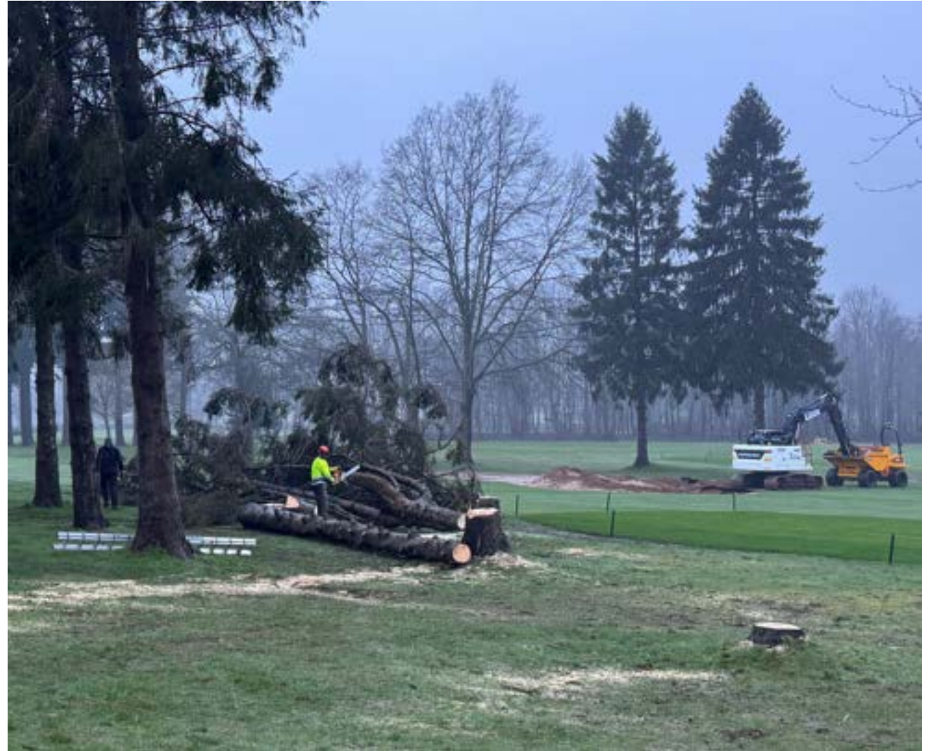
6 th Fairway Extension – Poor Turf Quality