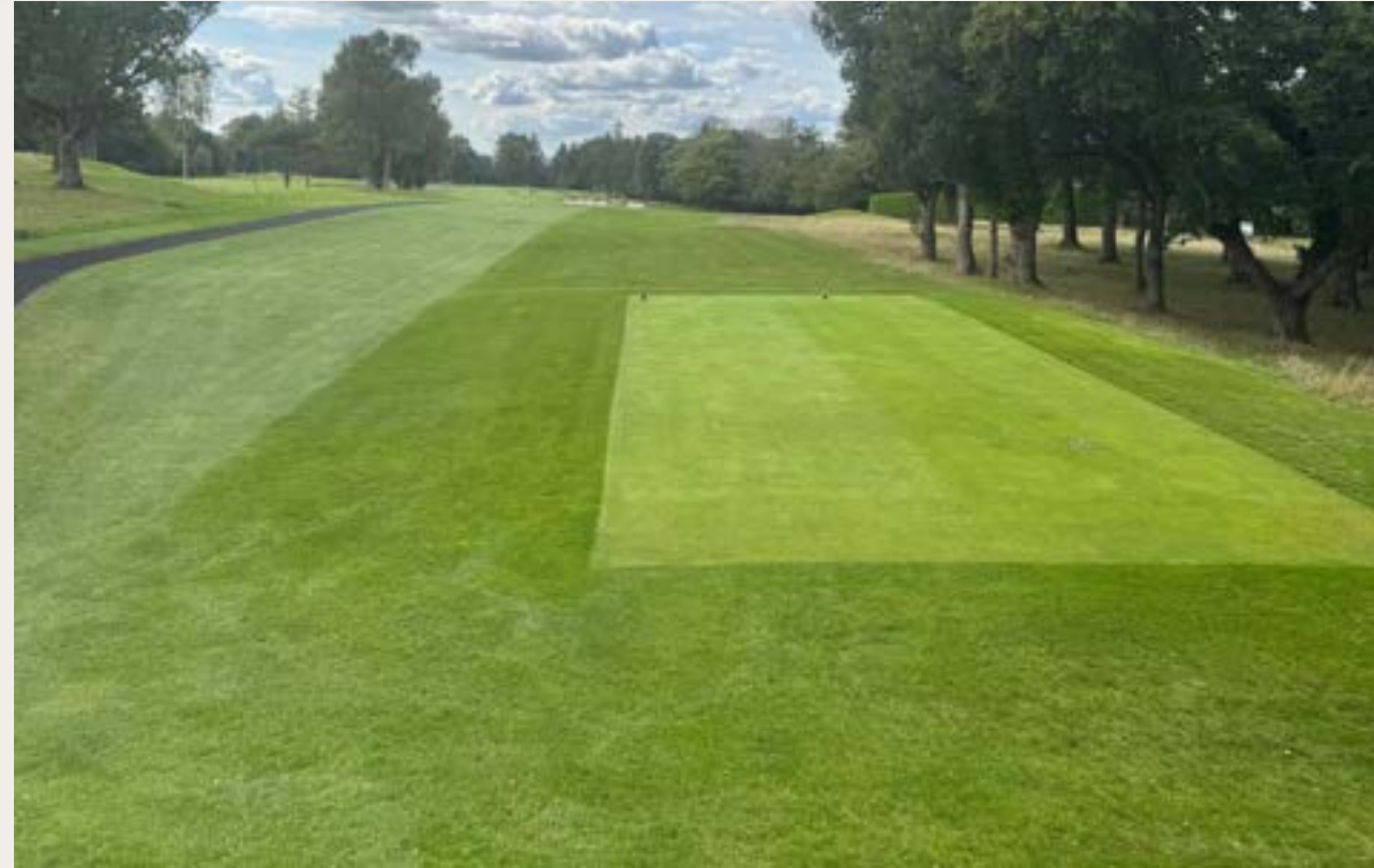
1st Carry With Irrigation