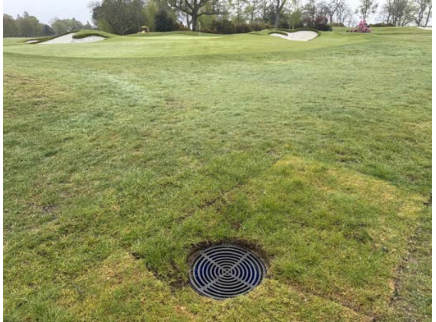
Soak-Aways Across 6th Tee & 8th Carry