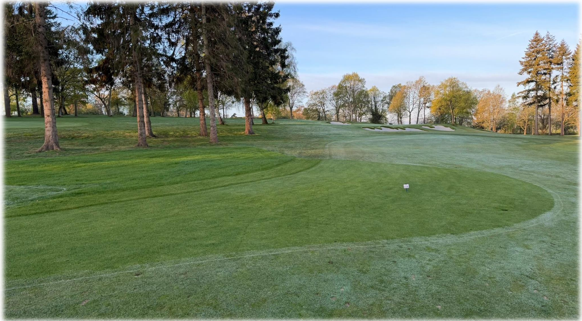
6 th Fairway Extension