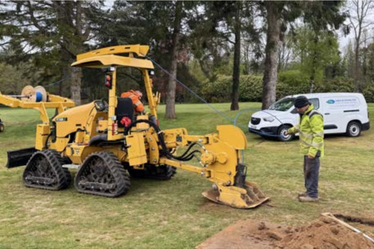
8th Carry Installation